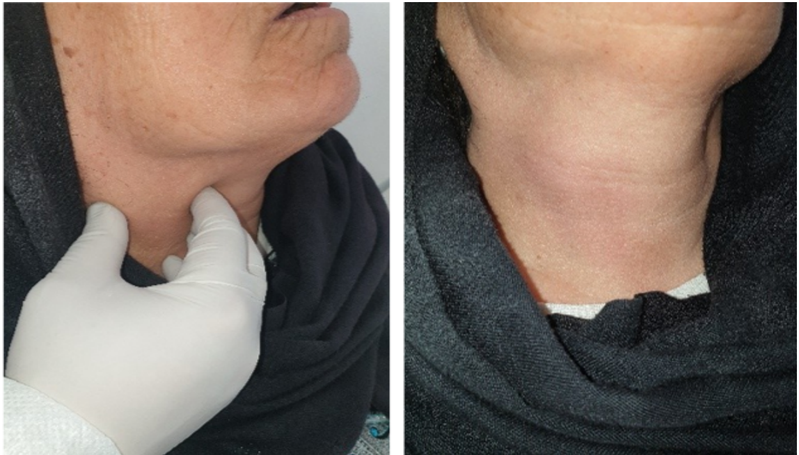
Figure 1: Showing swelling on the right side of the neck.

Intraoral examination revealed poor oral hygiene with the presence of local factors and signs of periodontitis. However, most notably, the right maxillary third molar is decayed and necrotic (Figure 2).