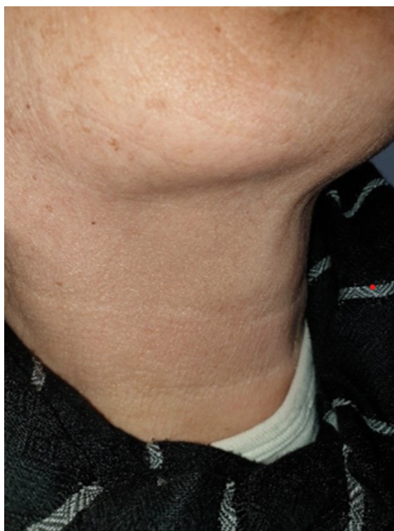
Figure 5: Complete regression of the swelling after 20 days.

(1000 mg twice a day). Swelling completely resolved within the first 10 days of the therapy. But treatment continued as per the protocol. After 20 days of follow-up, she was perfectly all right (Figure 5).