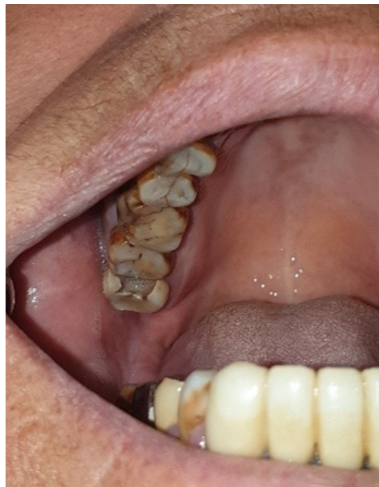
Figure 2: Intraoral view showing signs of decayed right third molar and signs of periodontitis.