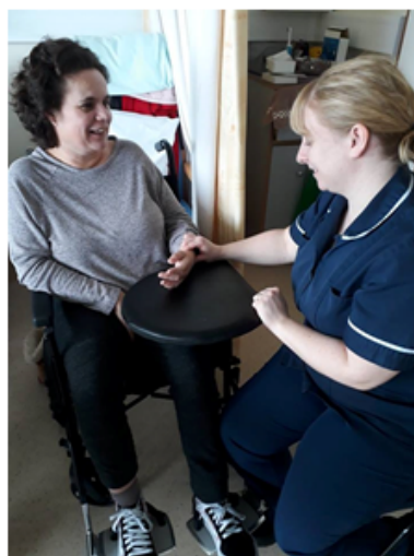
Figure 2: Assessing the pulse manually by palpation..