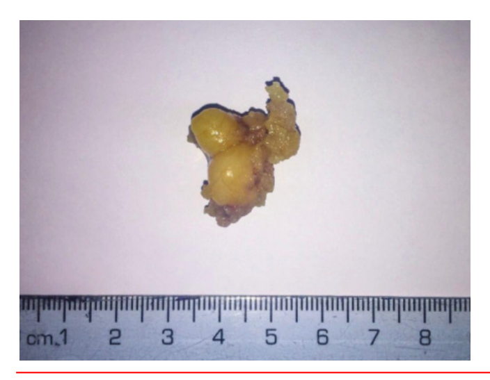
Figure 2: Macroscopy of subcutaneous nodule from excisional biopsy of left forearm.